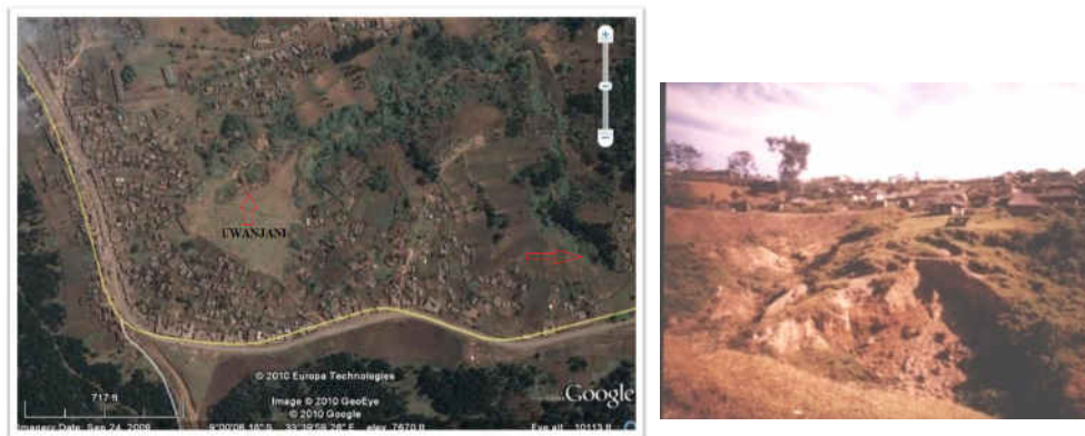
Figure 3: View of Uwanjani gully and built-up areas threatened by gully extension

The distance from heads of gullies to built-up areas decreases though gradually, at Uwanjani, Kwa Yuda, Nzumba, Machinjioni and Mwantaji sites (Plate 1). At Uwanjani, the gully is only 60 meters from the local government office building. Although the village has piped water supply since 1999, some