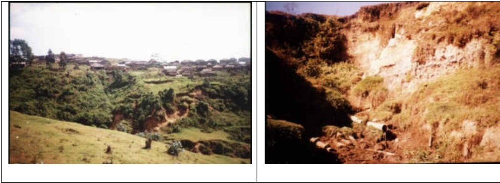
Plates 1 & 2: Gully extension into built up areas and structures for water collection

structure destructs the structures constructed for drawing water (Plate 2) making it difficult for women and children to fetch water.